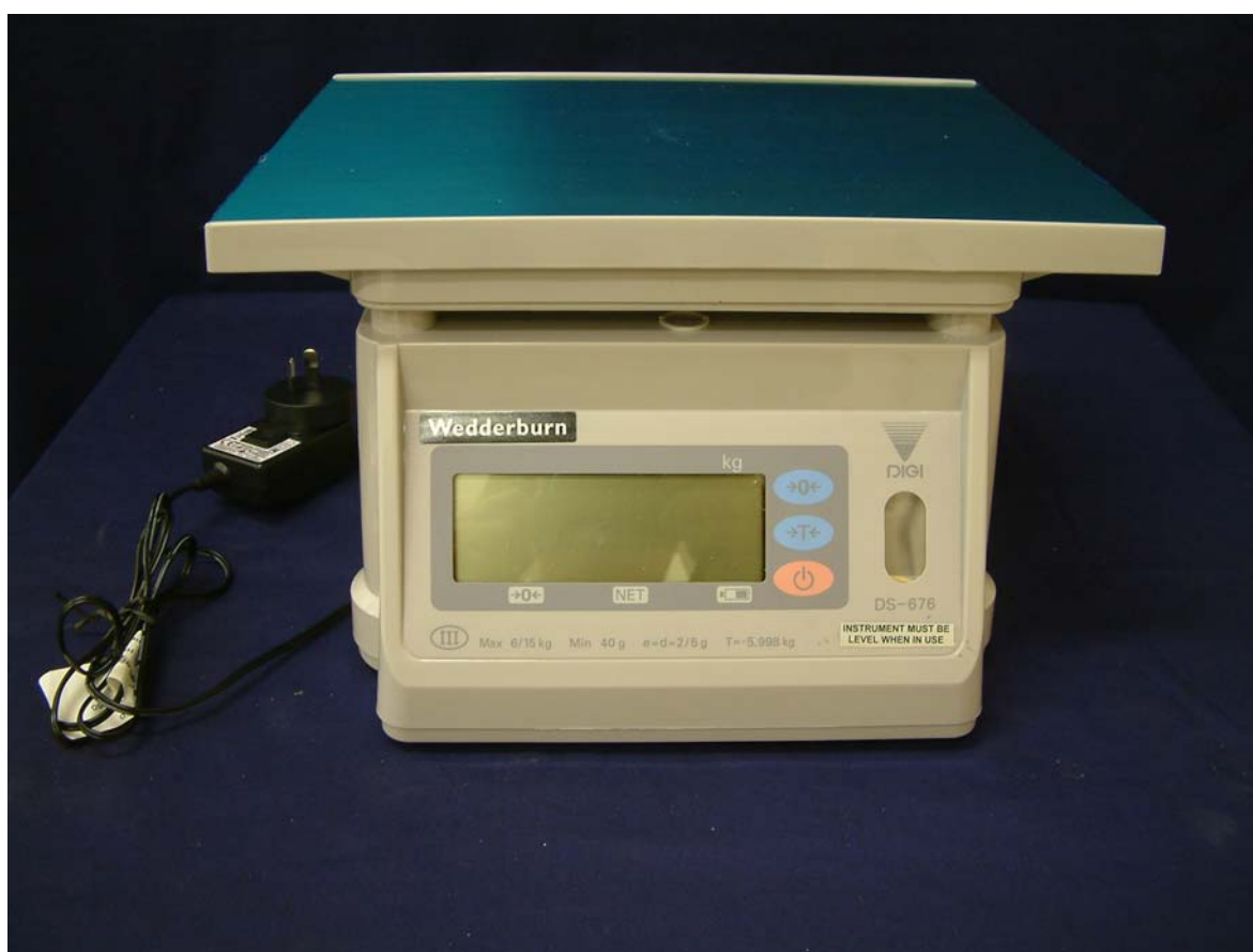
Teraoka Model Digi DS-676 Weighing Instrument (with large platter overlay)