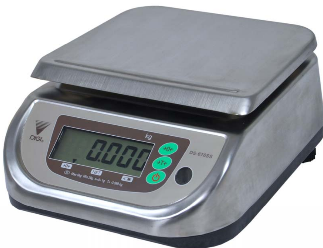
Teraoka Model Digi DS-676SS Weighing Instrument