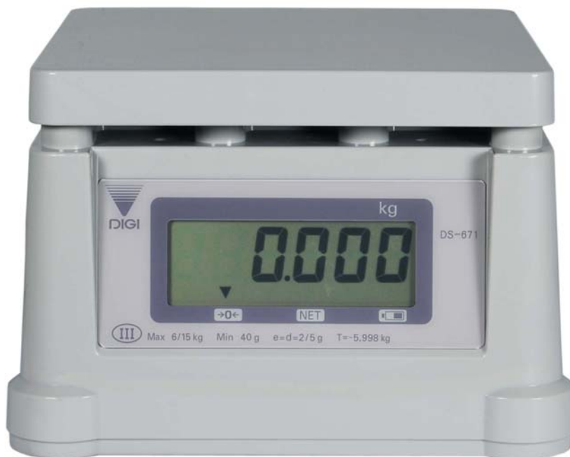
(b) Showing Customers' Display

Teraoka Model Digi DS-676 Weighing Instrument (with standard load receptor)