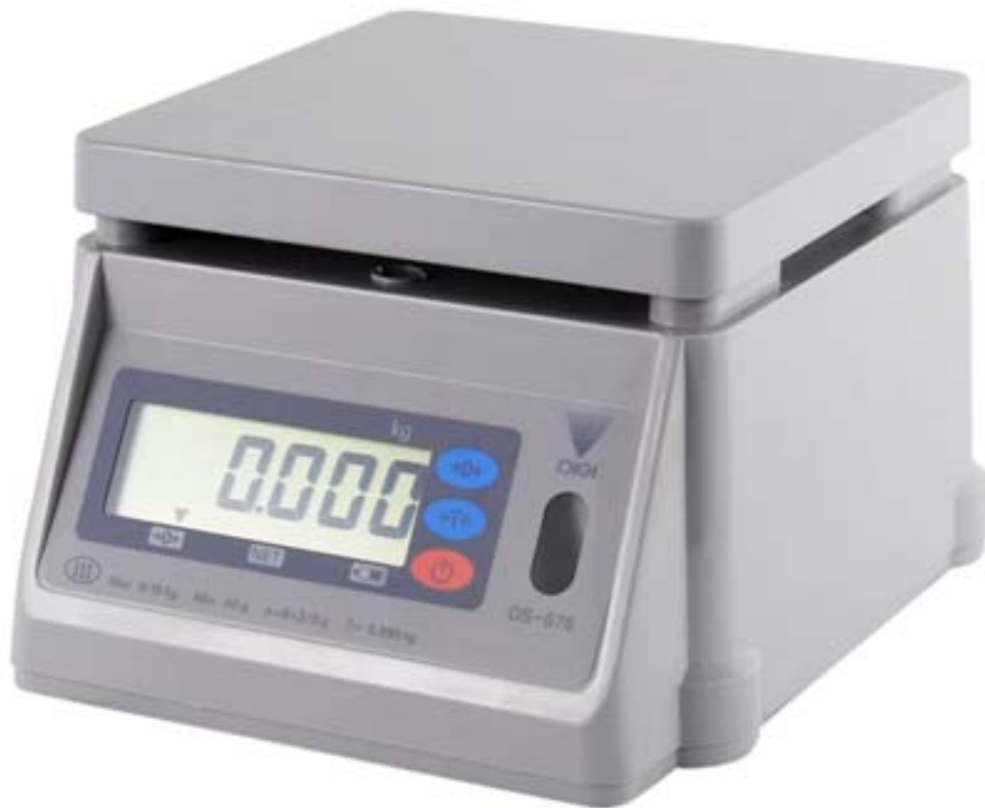
(a) Showing Operator's Display