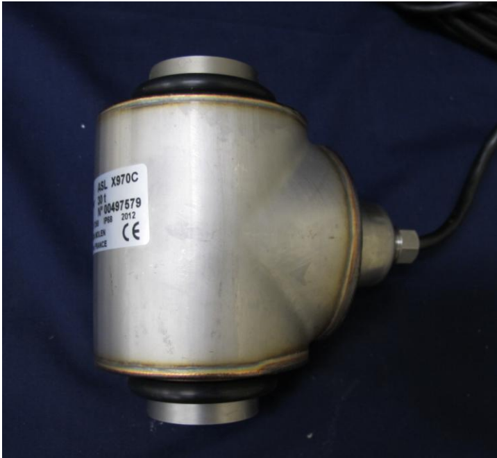
Precia-Molen Model ASL X970-C Digital Load Cell